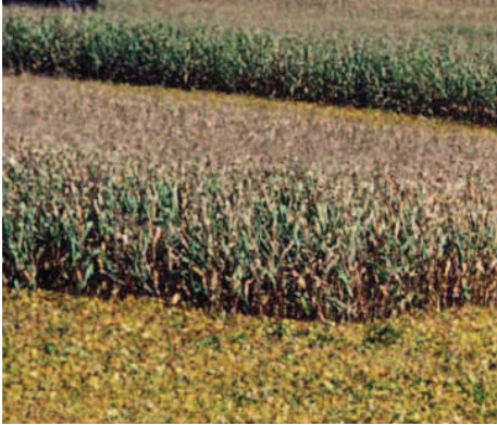
Stripcropping with Cover Crops, Lancaster County, PA.