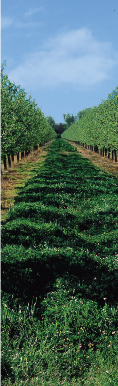
Cover crops in an orchard reduce soil erosion.