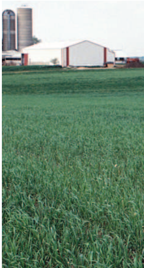
Cover crops on a field in Black Hawk County, Iowa.