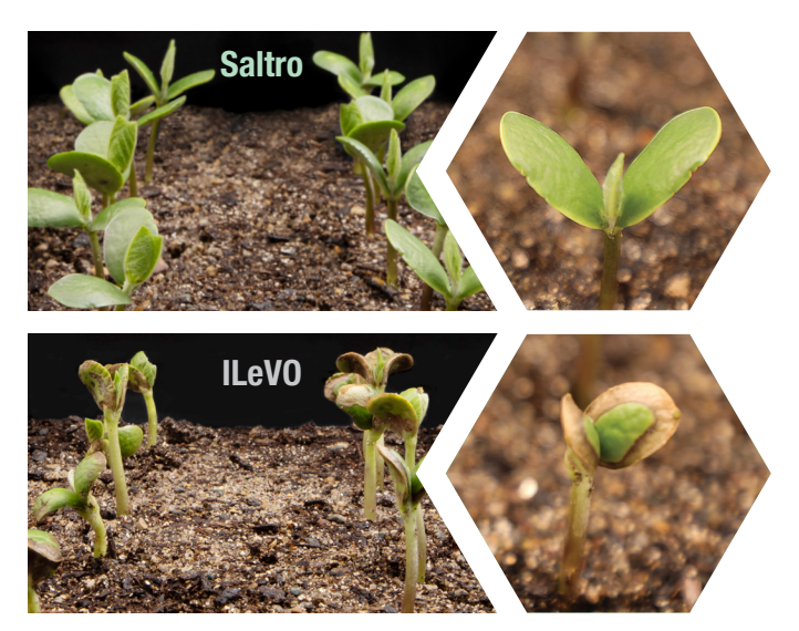
Syngenta trials at The Seedcare Institute™, Stanton, Minnesota; 10 days after planting in pest-free soil; April 2019.

As seen in the comparison to the right, at 10 days after planting into pest-free soil , Saltro-treated soybeans clearly look healthier and less stressed than the ILeVO treatment.